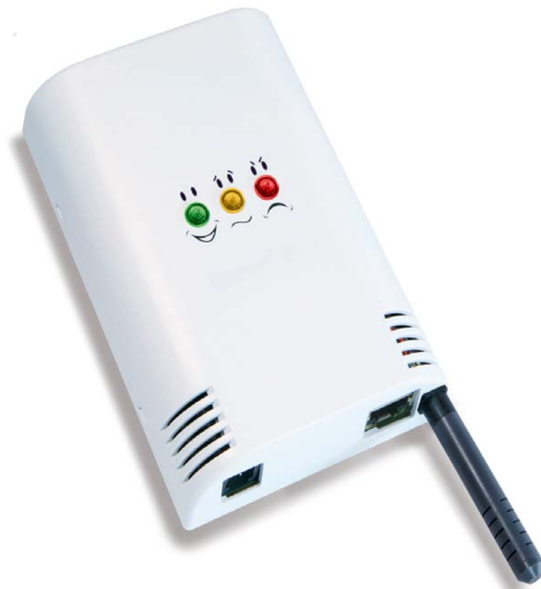
Fig. 1: AQ-CLIMATE CONTROL sensor system.

A two-beam infrared sensor (NDIR) is mounted on a sensor holder inside the plastic housing and above a diffusion opening to measure the carbon dioxide concentration. The sensors for the relative humidity (15 to 95 % RH) and temperature (0 to 50° C) are located in a sensing element made of PVC protruding from the bottom of the housing. The microprocessor for processing data, the digital outputs and an actuator (relay contact) are additionally integrated in the housing (see Fig. 1).