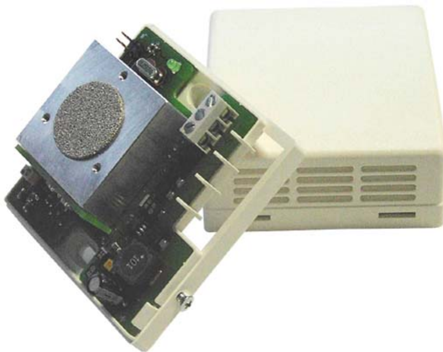
Fig. 1: Gas measuring system AQ-Transmit.

The two-beam infrared sensor is mounted in a plastic housing on a sensor holder above the diffusion opening. In addition, a transmitter containing a signal amplifier and an output of 4-20 mA or 0-10 V is arranged in the housing. The transmitter based on the three-wire system processes and transmits the measured signals (see Fig. 1).