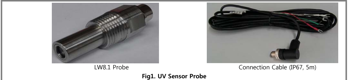
Fig1. UV Sensor Probe