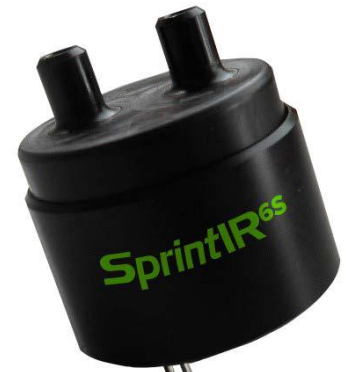
SprintIR 6S CO 2 sensor

* Based on a step change in the circulation rate of 0.1 liters per minute and the 0 - 10% CO 2 concentration.