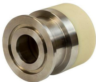
H1 KF-40 Sensor Housing