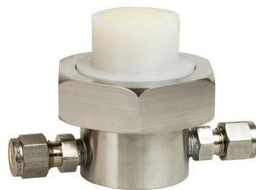
H3 Flow Throw Sensor Housing