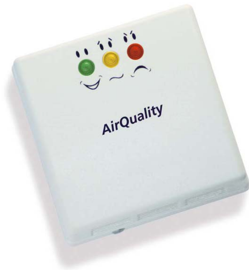
Fig. 1: AQ-CONTROL gas measuring system.

The two-beam infrared sensor is mounted on a sensor holder in a plastic housing over a diffusion opening. The plastic housing also contains the transmitter that processes and evaluates the measurement signals, two independent relay outputs, as well as three LEDs (green, yellow, red) for visual display of the measured values (see Fig. 1).